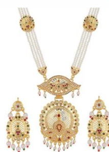
Jewellery Gold Plated Pearl Stone Meenakari Rajwadi Rajasthani Kundan Beaded Necklace set