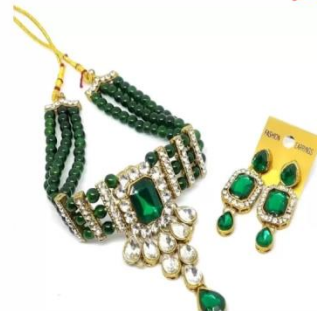
Green, White, Gold Jewel Set (Pack of 1)