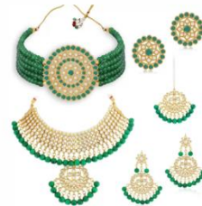
Green Jewel Set (Pack of 1)