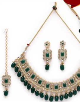
Green Jewel Set (Pack of 4)