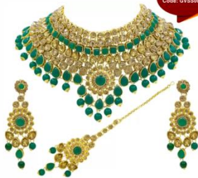
Green Jewel Set