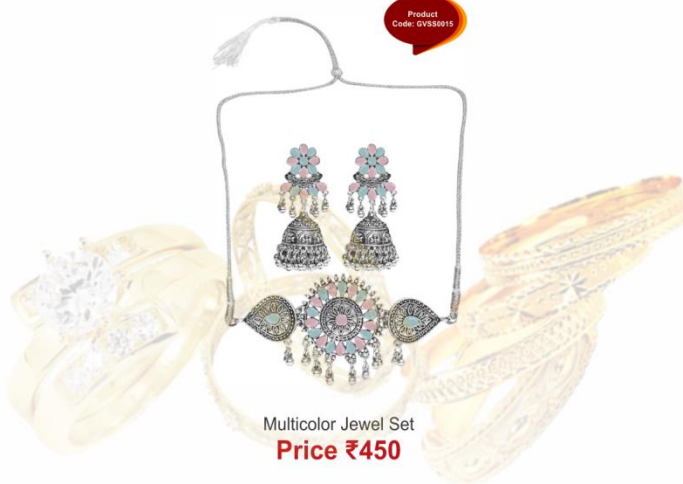
Multicolor Jewel Set Price ₹450