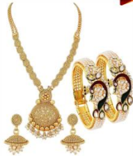
Jewellery Sets for Women Gold Plated Necklace Jewellery Set with Earrings and Bangles Combo for GirlsWomen