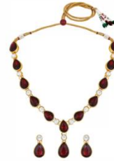
Jewellery Gold Plated Pearl Stone Meenakari Rajwadi Rajasthan Kundan Beaded Necklace set